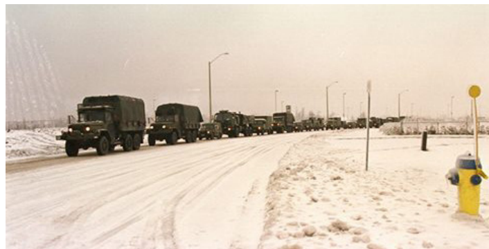
A convoy of troops from Petawawa arrive in Ottawa to assist their fellow Canadians during the state of emergency, 9 January 1998.

The troops quickly got to work clearing roads for emergency vehicles, restoring telephone communication, removing