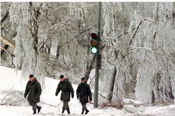
Members of the Canadian Armed Forces walk to their headquarters in Westmount, Que., on 9 January 1998.