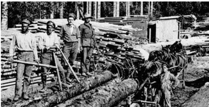
Canadian Forestry Corps, Timber Yard, France c. 1918 (Credit: Canada DND/ LAC M# 3523256).

illness as a result of their harsh living and working conditions. Eight members of the battalion died overseas.