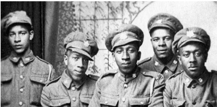
Members of No. 2 Construction Battalion.

When the First World War broke out, thousands of African Canadians rushed to enlist. Nearly all of them were turned away by white recruiting officers and told that they had no place in a "White Man's War." In response, Black Canadians across the country mounted a pro-enlistment campaign and pressured