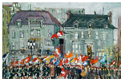
Bobak's "Remembrance Day".

During Molly Lamb Bobak's time in the army she kept an illustrated diary that recorded her experiences and poked fun at the military institution. It can be viewed online at Library and Archives Canada .