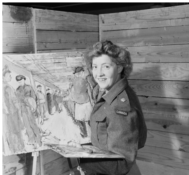
Molly Lamb Bobak, war artist in the CWAC. Photo taken in London, England, 12 July 1945

In the winter of 1942, Prime Minister Mackenzie King approved the creation of the Canadian War Records Committee, a program designed to produce an artistic record of Canada's Second World War experience that was led