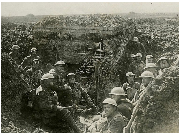
Canadians occupying a German gun emplacement destroyed by the rolling Canadian artillery fire at Vimy.

Through a combination of new triangulation methods, observations of muzzle flashes, and pinpointing the origination of sounds, the Canadians were able to locate some