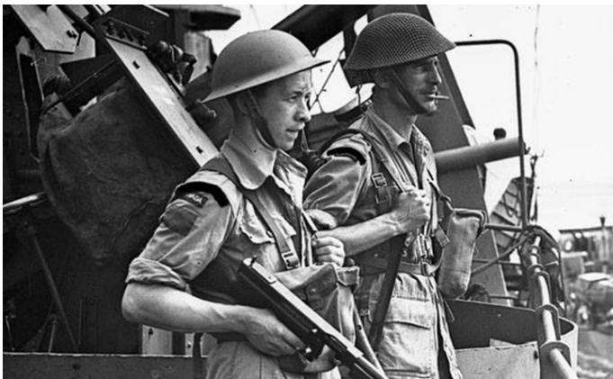
Canadian troops en route to Sicily. n.d. (Credit: Canada. DND/LAC).

Operation Husky, the allied invasion of Sicily, began shortly after midnight on the morning of July 10, 1943, when the transport ships carrying allied troops dropped anchor seven miles off the Amber Coast. Canadians were not originally scheduled to participate in the invasion and it required the personal intercession of Prime Minister Mackenzie King before Britain reluctantly invited Canadian troops. After a month long voyage from Scotland through U-boat infested waters, the Canadians were eager to see action.