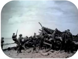
D-Day Series: RCN and Operation Neptune

Our YouTube channel hosts over 150 short, Canadian military history documentaries. Check out these videos today: