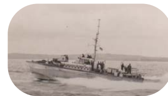
Charles Dawson (The Field of Crosses)