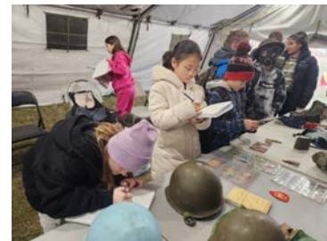
Young minds engaged, taking notes at our artifact-handling table for a