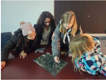
Four Girl Guides independently engaged in the "Battlefield Reconnaissance" activity.

school project. (This group was not planned - they just happened to pass by our tent!)