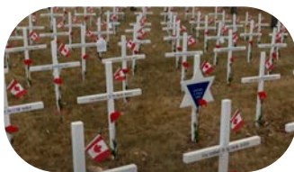
Service of Remembrance (The Field of Crosses)

Our YouTube channel hosts over 170 short, Canadian military history documentaries. Check out these videos today: