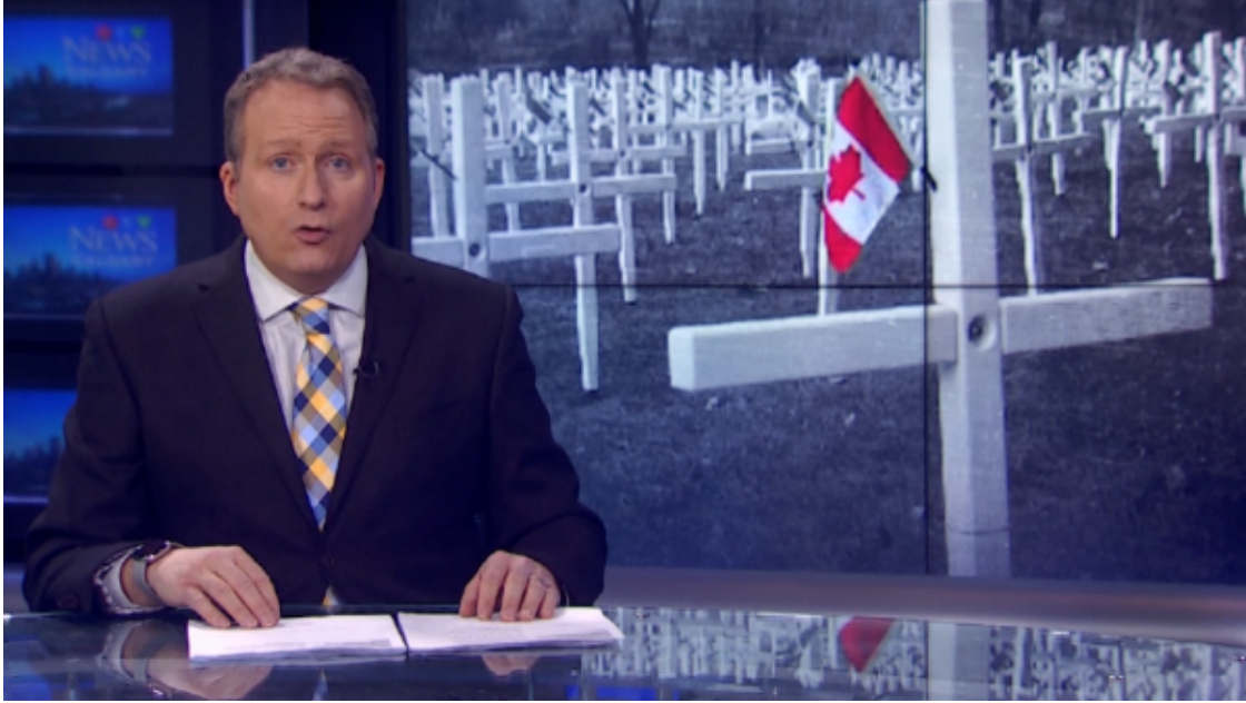
Photo: a screenshot from the CTV news report of the 2023 General Sir Arthur Currie Award

Click here or the image below to view the CTV news report.