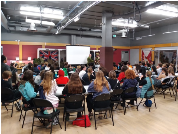
April 10: Students from Senator Patrick Burns School at TMM