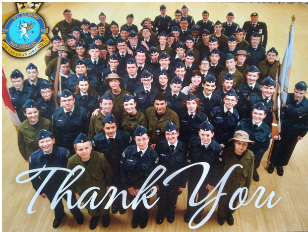
April 18: Cover of a thank-you card received from 522 RCACS (St. Albert)