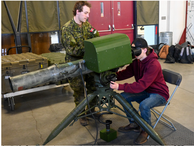
April 18: Student trying an anti-tank targeting device (training) at CFB Edmonton