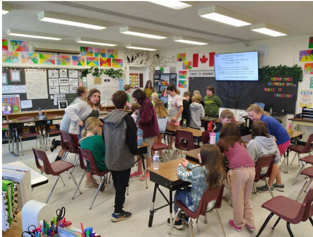
May 7: Students from Pineview Elementary School (Athens, ON) engaged in the Battlefield Reconnaissance activity