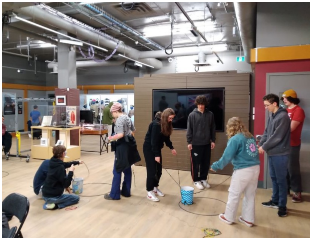
April 4: Students from Queen Elizabeth High School at TMM