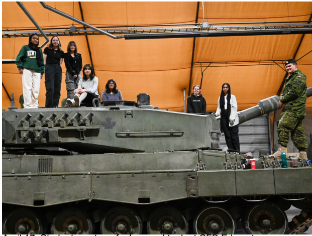
April 17: Students on top of a Leopard tank at CFB Edmonton