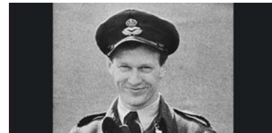
Ian Bazalgette, VC

Please subscribe, like and share our videos here!