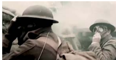
Gas! Gas! Gas!