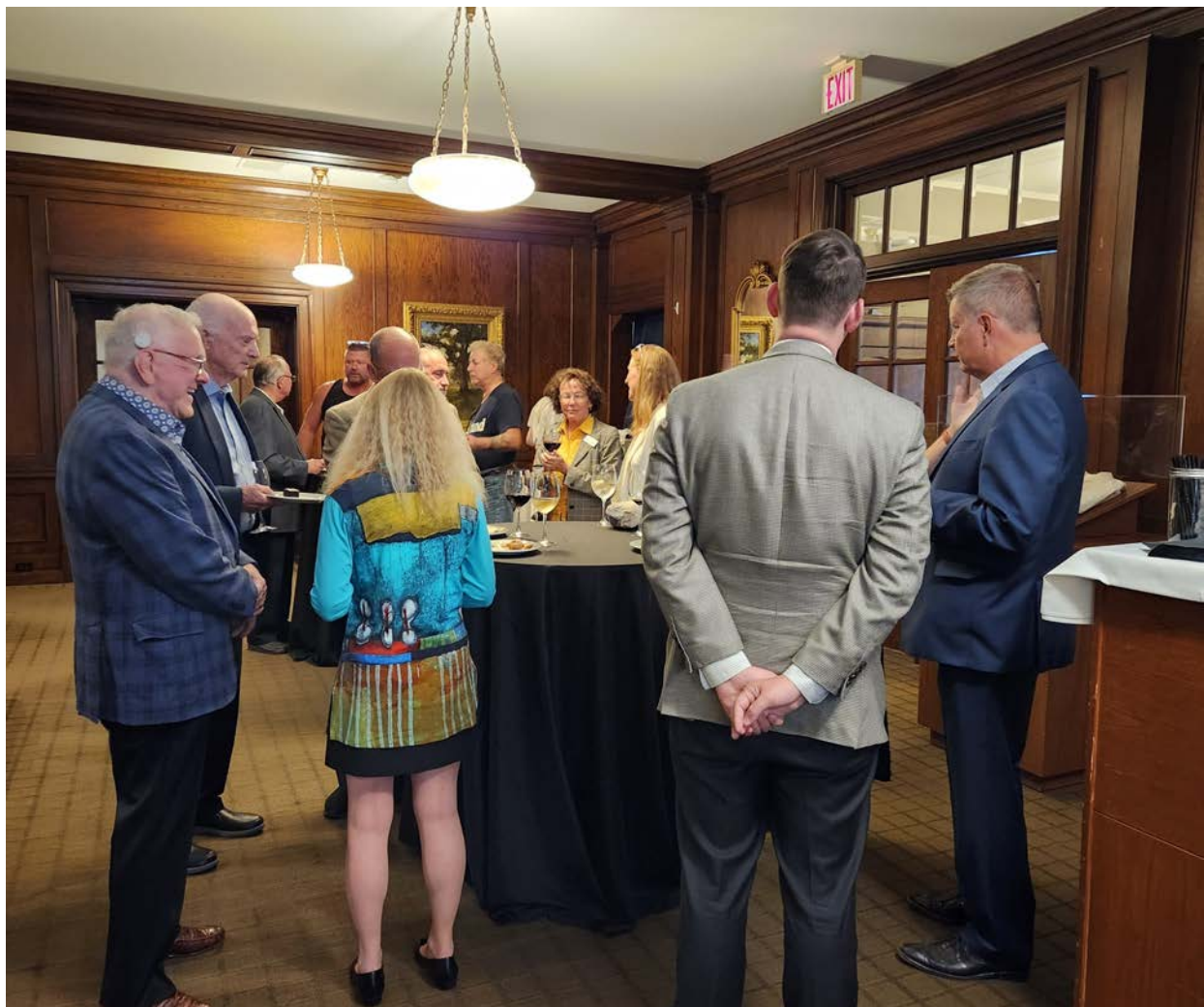
Photo: Guests socializing over refreshments on the evening of August 14 at the Ranchmen's Club.