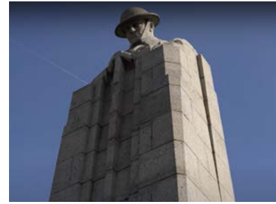
Gas Attack - Ypres 1915

Please subscribe, like and share our videos here!