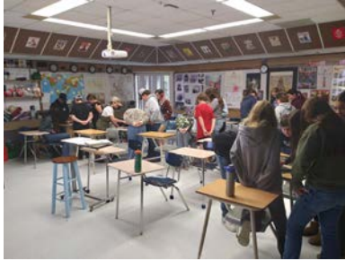
Maidstone High School (Oct 22)