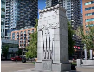
The Calgary Cenotaph: Remembering a Legacy