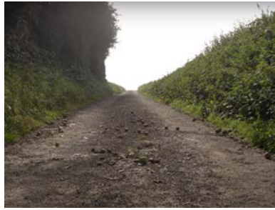
A Good Battlefield Tourist & Life in the Muddy Trenches

Our YouTube channel hosts over 180 short, Canadian military history documentaries. Check out these videos today: