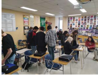
Lloydminster Comprehensive High School (Oct 23)