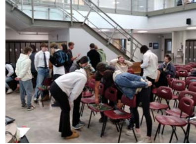
Holy Rosary High School (Oct 24)

Our military history library contains over 260 compelling and educational stories from Canada's military history.