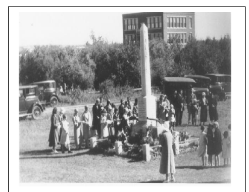
Beverly Cenotaph, Edmonton