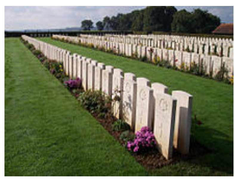
Dieppe War cemetery

Allied dead were initially buried in a mass grave, but the bodies were subsequently disinterred and reburied at Vertus Wood on the edge of the town. The present Dieppe Canadian War Cemetery headstones have been placed back-to-back in double rows, the norm for a German war cemetery, but unusual for Commonwealth War Graves Commission sites. When the Allies liberated Dieppe as part of Operation Fusilade in 1944, the grave markers were replaced but the layout was left unchanged to avoid disturbing the remains.