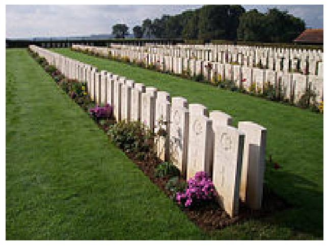
Dieppe War Cemetery

Dieppe Raid 1942 Plaque for No.4 Commando at Saint-Marguerite-Sur-Mer