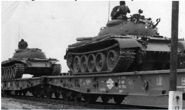
Венгерские Т-55 с башнями, развёрнутыми назад для перевозки по ж/д, 1985

Illia Ponomarenko @IAPonomarenko 22 Mar tweeted: Holy cow, I've lived to see Russians de-mothball my favorite early Cold War legacy T-54/55s. Again: T-54s. Remember — the special military operation is running in full compliance with the plan as scheduled.