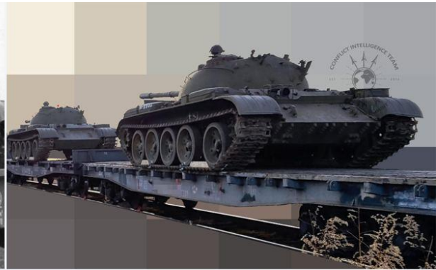
Российские Т-54/55 с башнями, развёрнутыми назад для перевозки по ж/д, 2023