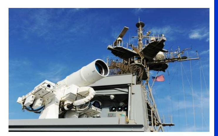
Experimental Laser Weapon System on board the USS PONCE